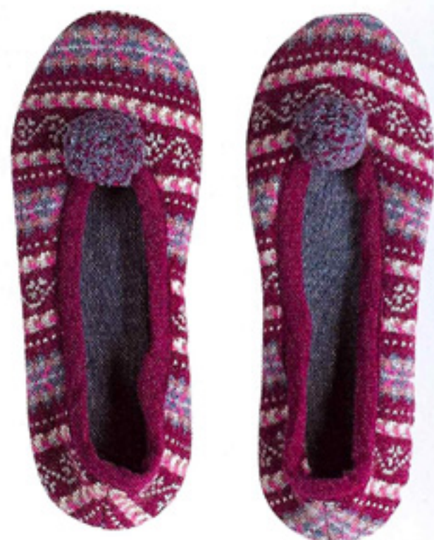
From left 'Zillij' wool rug, £1,400, Niki Jones (niki-jones.co.uk). 'Fairisle' cashmere slippers with pom-poms, £79, Brora (brora.co.uk)