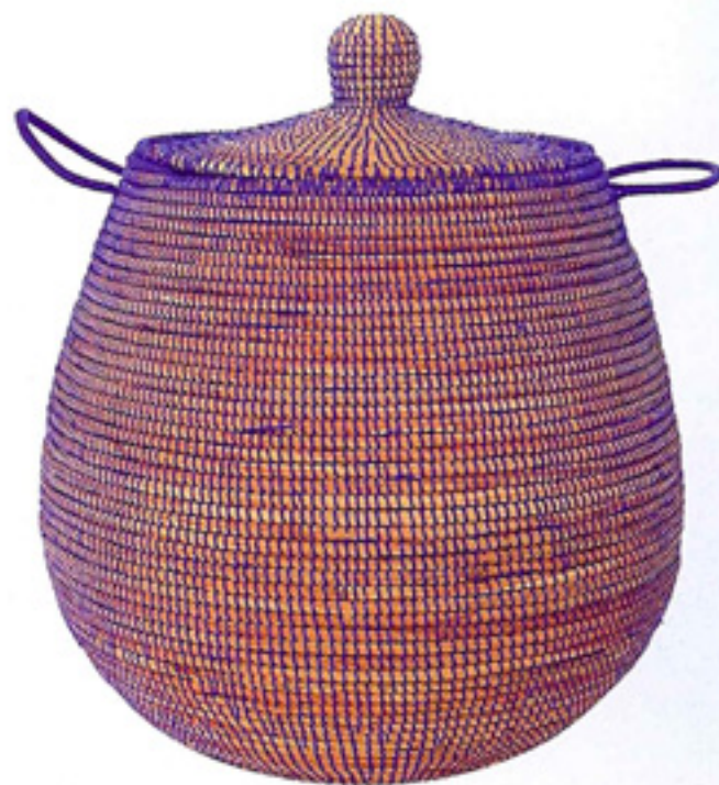
From left Wool/cashmere/silk throw in 'Plum', £260, Shanghai Tang (shanghaitang.com). Cotton bed linen, £29.99 for two pillowcases and a double duvet cover, H&M (hm.com). Silk pillow inner, £79, Gingerlily (gingerlily.co.uk). 'Branch' cotton cushion, £73.50, Nordic Elements (nordicelements.com). 'Lhanbryde' cashmere throw, £295, Toast (toast.co.uk). 'Ali Baba' recycled plastic laundry basket by EA Déco, from £88, L&B (london.com)