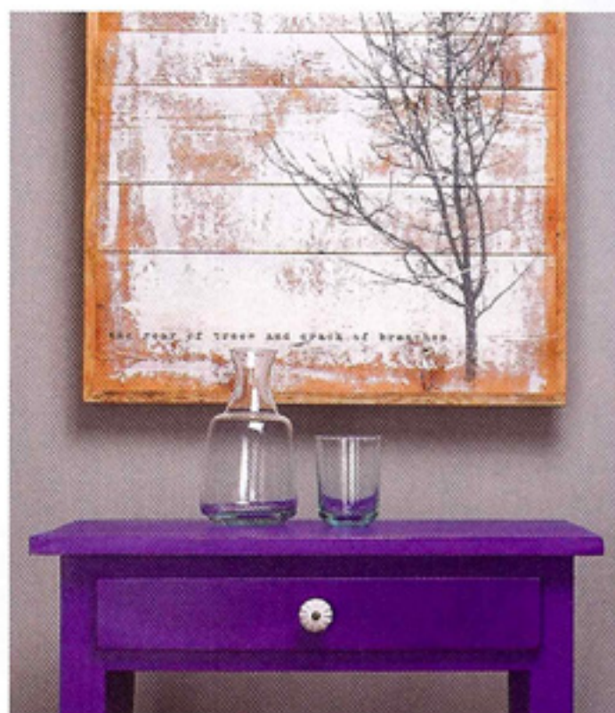
From left 'Urban' plastic chair, £25, Ikea (ikea.com). 'Warm Stratum' wool/cotton throw by Edmond Frette, £280, L&B (london.com). 'Heritage Toile' cotton bed linen, from £25 for a set; 'Riviera Stripe' cotton bed linen, from £39.50 for a set, both Marks & Spencer (marksandspencer.com). 'Minna' mango-wood side table, £239, Plümo (plumo.com). Flask and glass, £19, Toast (toast.co.uk). Reclaimed wood wall hanging, £99, Coulson Macleod (coulsonmacleod.com) ▶