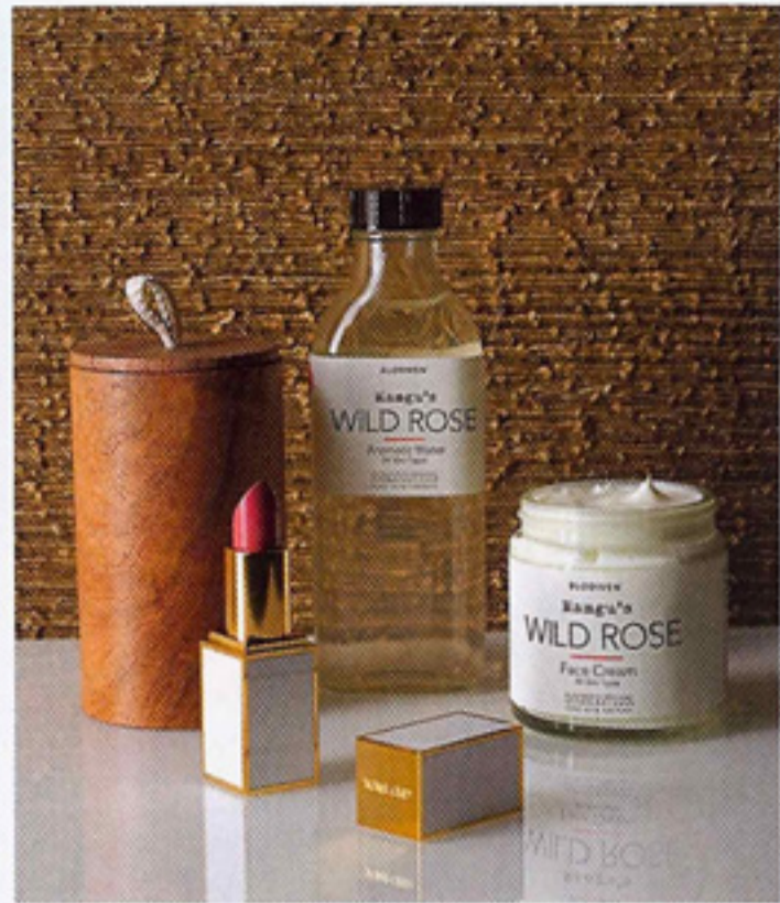
Above, from left 'Poza' hardwood lidded container by Alta Pampa, £27.50, L&B (london.com). 'Pink Dusk' lipstick , £35, Tom Ford (tomford.com). 'Mangu's Organic Wild Rose' aromatic water , £15; face cream , £25, both Blodwen (blodwen.com). 'Knotted Hemp' wall covering in Khaki by Maya Romanoff, £145 per m (91.4cm W) Pierre Frey (pierrefrey.com)