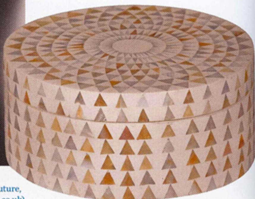
Sitting pretty continued... From left 'Ames' glass dressing table in Cappuccino, £949; 'Keppler' upholstered stool in Dove Grey, £469; 'Westcott' glass candlesticks : small, £30; large, £35, all by Casa Couture, House of Fraser (hof.co.uk). 'Concentric' mother-of-pearl inlay jewellery box , £140, Niki Jones (niki-jones.co.uk)