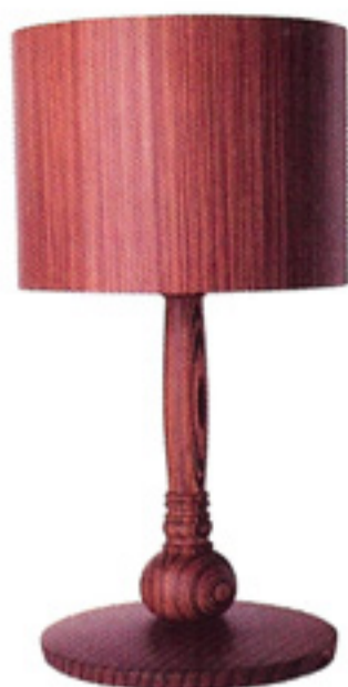
Moooi's Tree table lamp (£915) is made entirely from wood, with a stunning Zebano finish and a comforting, natural feel.