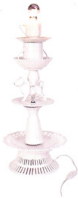
This exquisite table light (£540) by mat&jewski was made in Paris by stacking everyday objects made of the finest white porcelain.