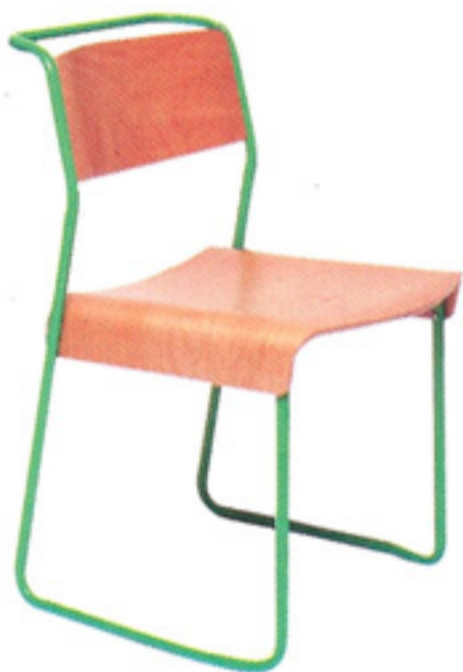
The Canteen Utility Chair (£195) by Ed Carpenter for Very Good and Proper is designed in powder-coated steel and pressed beech plywood.