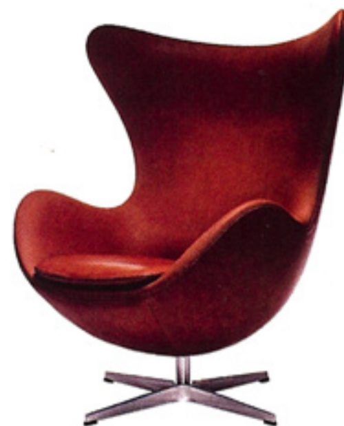
Fritz Hansen's iconic and timeless Egg™ chair (£7,975) is making its Liberty debut in the most luxurious walnut leather.