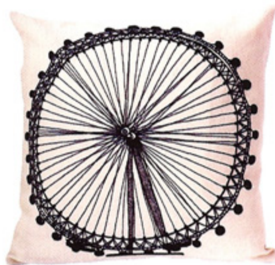
Charlene Mullen's playful London Eye cushion (£120) combines architecture and comfort in soft embroidered linen.